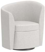
Via Left (Raised) Model Number: VIAL