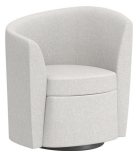
Jr. Via Left (Raised) - 14" Seat Height Model Number: VIAJL

Comes standard with Swivel Black Base Refer to the front page for options